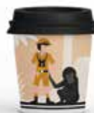
ID 530209 / 530210 / 530211