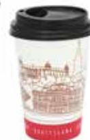
ID 530095 / 530212 / 530096 / 530213