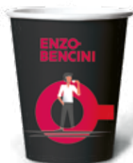
ID 530205 / 530206 / 530207 / 530208