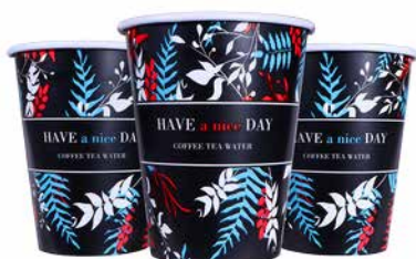
ID 530230 / 530232